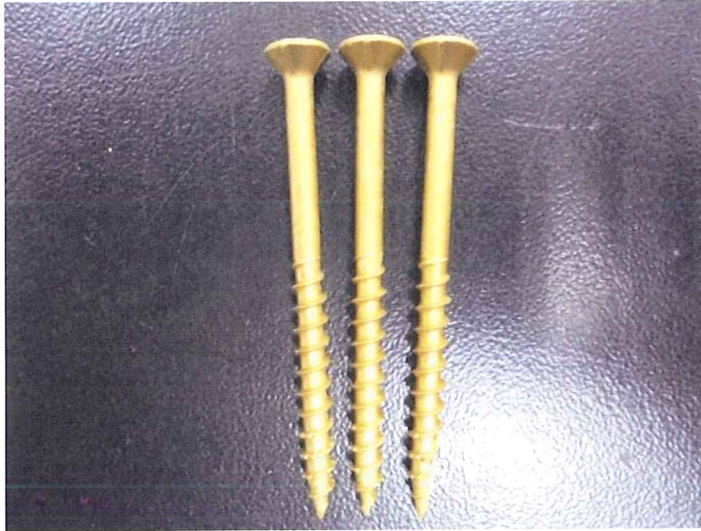
Fig. 1 : Before test