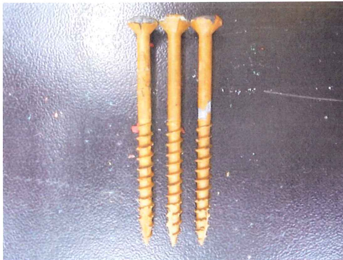
Fig. 3 : After 20 cycles(After test)