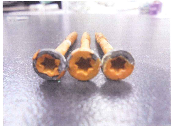
Fig. 4 : After 20 cycles(After test)